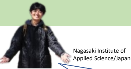
Nagasaki Institute of Applied Science/Japan