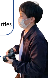
Nagasaki University /Japan

Glocal Talk, Presentation Competition, World Cooking Day, Japan Culture Experience, Parties etc.