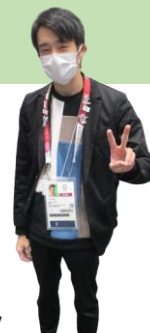
Nagasaki University of Foreign Studies/Japan

There are international students and Japanese students from all over Nagasaki. You can make friends with students from various countries and other universities.