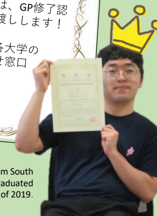
Senior GP member from South Korea, certified and graduated in the year of 2019.