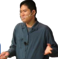
Nagasaki University of Foreign Studies/Japan

We have many events such as presentation competition and café talk. Student leaders plan and manage these events with helping each other. Why don't you join us and have good time to plan events yourself?